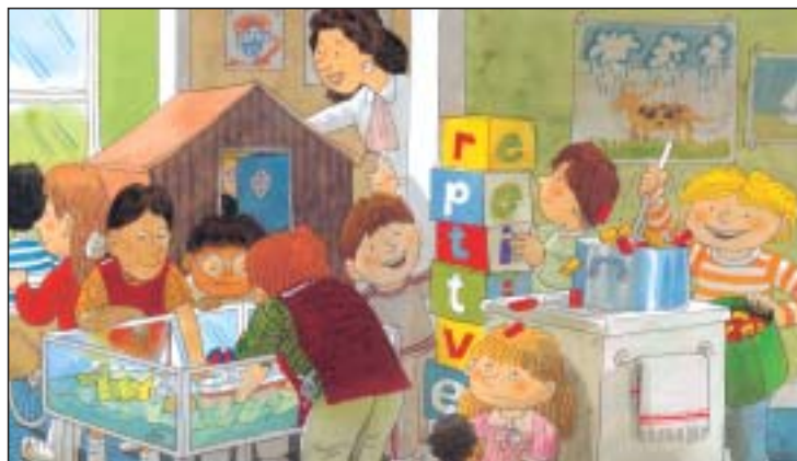
Stage 1 Kipper Storybook

The first twelve storybooks at Stage 1 use pictures without any words to tell the story. The pictures are full of detail and humour, making them fun for the child to use. These picture storybooks teach children important skills: to talk about the pictures to create their own story and to make the connection between the picture and the story – invaluable at later stages to help children read an unfamiliar word.